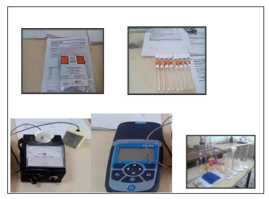
Figure 2 Chemicals and equipment used