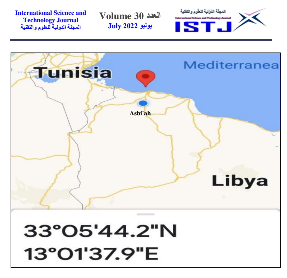
Figure 1 Data collection area

All fresh samples were obtained directly from the head of the wells while the water coming out. The average depths of the wells were between 100-200 m. One litter of each collected water samples were stored at 4 ^{0} C. The investigations were carried out in the laboratory immediately next day of work.